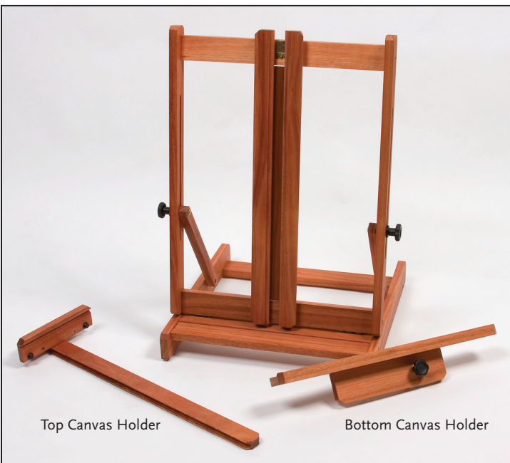
Top Canvas Holder