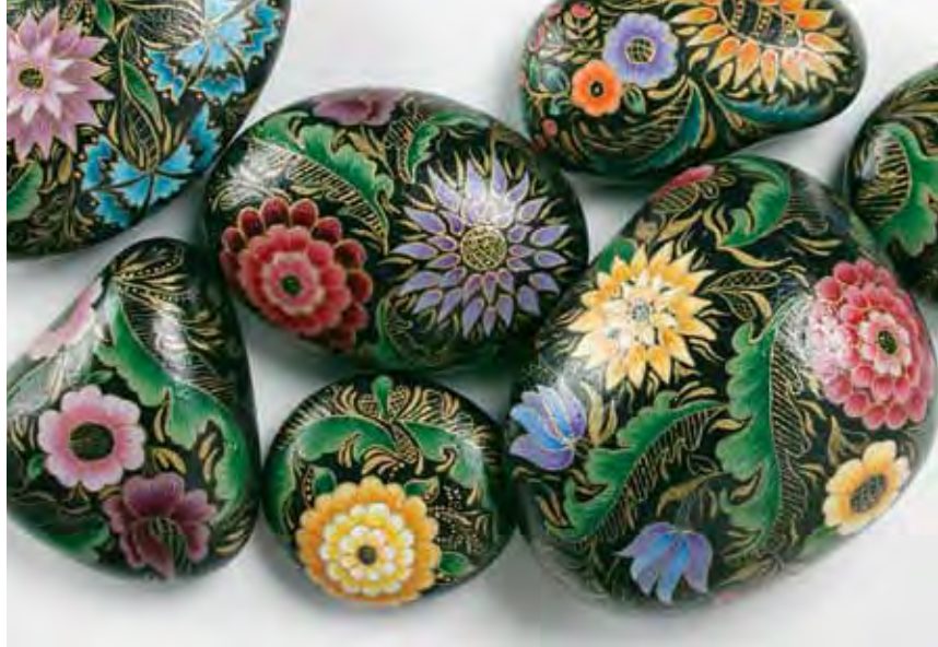
Painted rocks by Nancy Nelson

The fiber used in the heads of series 9020, 9030, 9040, 9050, 9060, and 9070 is a mixture of seven different synthetic fibers that have been mixed and blended to achieve the finest performance. Tough enough for painting on textured surfaces such as wood and canvas, yet they are gentle enough for watercolor.