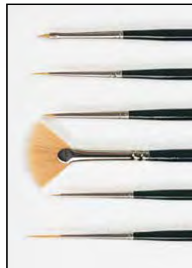
9070 Spotter Series Size Chart