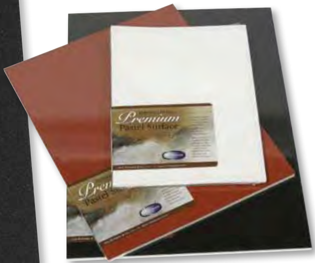
Pastel Surface Sampler Set Contains 3 surfaces in 3 colors. NUMBER 105900 9" x 12" - Colors may vary